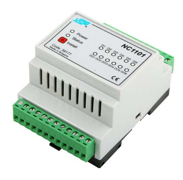
2 YEAR WARRANTY